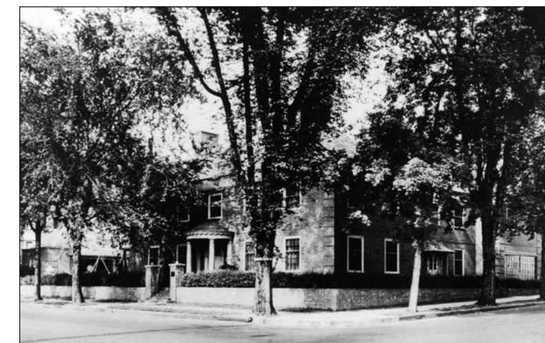
Fruit & Flower paid a total of $20,500 for both the lot and building, which was finished in 1928. The building, at SW 12 th and Market, is now part of the Portland State University campus

increased flexibility on the Center's part. This led the board of directors through a period of introspection. The result? A change of scenery.