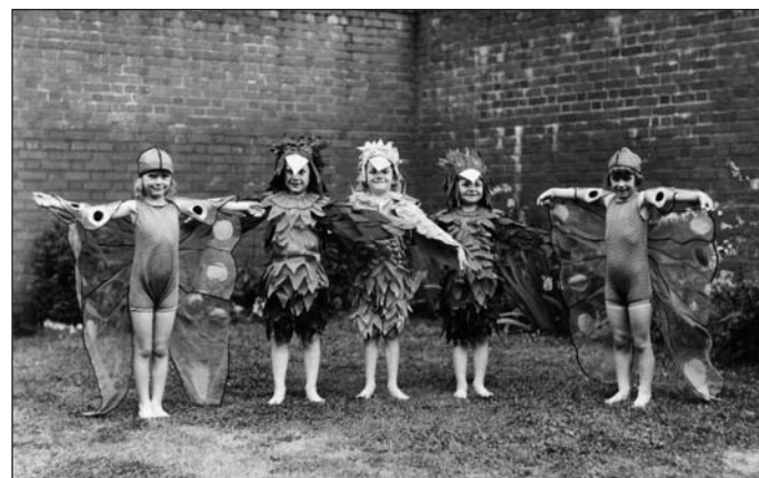
All dressed up: "The Awakening of Spring" was the theme for this 1930 pageant