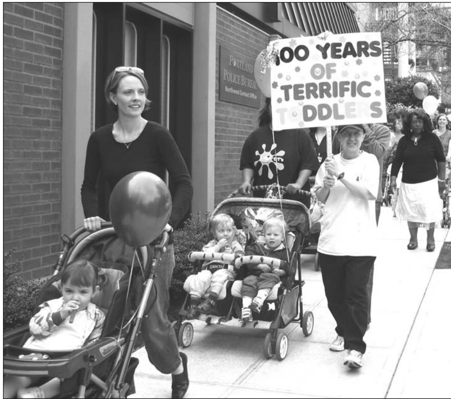
Fruit & Flower children, parents and staff take to the streets on April 7, 2005, for a parade to celebrate the start of the Center's centennial year.