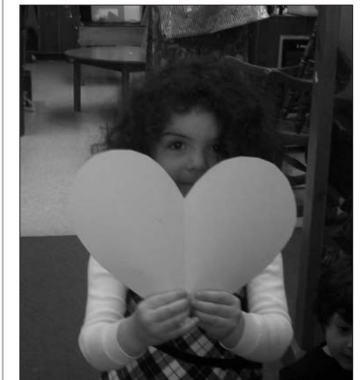
Happy Valentines Day!